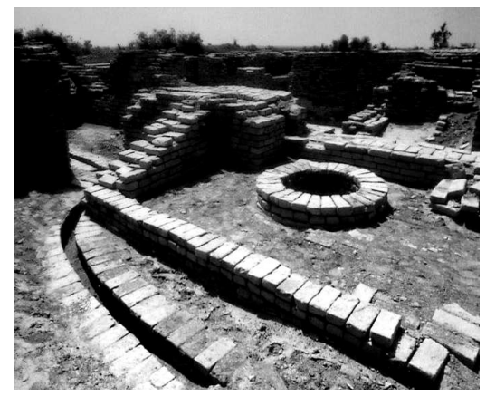
A nearby well provided the water and could be emptied through a drain.

Mohenjo-daro city was situated on a slope between two streams. At the point where one of the streams meet the city's walls, people carved a large reservoir out of rock. This was connected to a network of small and big reservoirs that distributed water to the entire city all year round. When you have such an extensive domestic water storage system, the next problem that arises is that of drainage. Town planners of Mohenjo-daro had built the worlds first known main drainage system. It was a central system that connected every household in the city. Almost every house had a drinking water well, with a private bathroom. Earthenware waste pipes carried sewage from each home into covered channels that ran along the centres of the city's main streets into the nearby agricultural fields, rivers, or streams. The drains took waste from kitchens, bathrooms, and indoor toilets. The main drains even had movable stone slabs as inspection points. The houses had excellent plumbing facilities for provision of water.