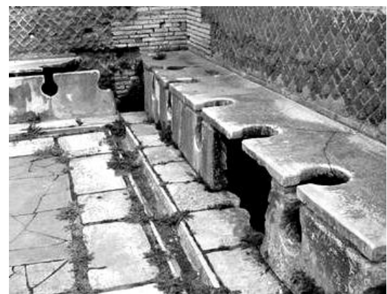
Mohenjo-Daro had a flush system in almost every house.

The relation of modern engineering to ancient engineering is difficult to comprehend considering that modern engineering is so highly specialized and technologically advanced. Design and rules-of thumb, empirical equations, physics, numerical methods, computer simulators, and other engineering tools taken for granted today were not available to ancient engineers. Despite the supreme technological advantage today's engineer has over the ancient engineer, fantastic engineering feats rivalling those of today were achieved throughout history. For example, the Indus Valley civilization of northwestern India flourished from 2600-1900 BCE. Harappa, Lothal, and Mohenjo-daro are three of the extensive archeological excavations in the region, a UNESCO World Heritage Site. They are noted for sophisticated public works that included sewage drainage systems, public wells, and private and public baths. Mohenjo-Daro's "chief glory" was a complex system of drains that ran throughout the city. According to one scholar, "only the Romans, more than two thousand years later, had a comparable drainage system."