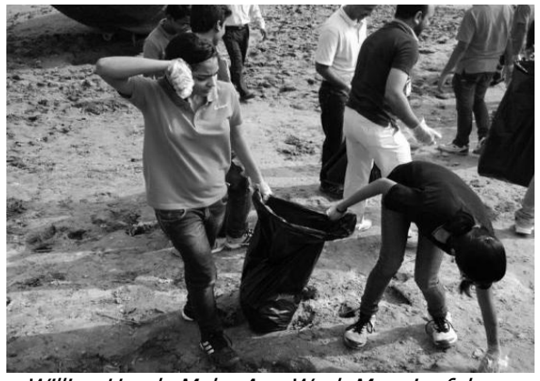
Willing Hands Make Any Work Meaningful

In the 21st century, the country is at a turning point. Time is running out faster than ever, and any further delay in implementation of sanitation and environmental programmes will cause irreparable damage to both nature and human beings. No army or professionals, howsoever big, and even well paid, can clean up the squalor left behind by 1.3 billion people... Each one of those 1.3 billion has to act responsibly and not litter and take care of their own garbage. The individuals, households, schools are the places where this fight has to begin and be won!